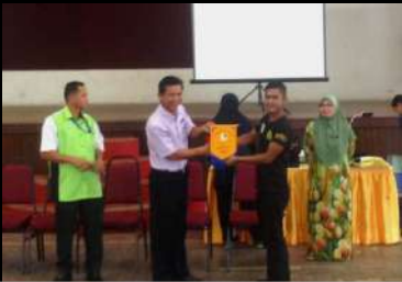
Public awareness at 3 schools in Keningau district