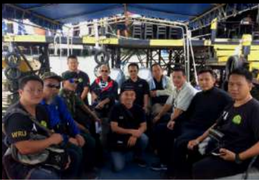
Assistance on turtle poaching crime investigation at Semporna