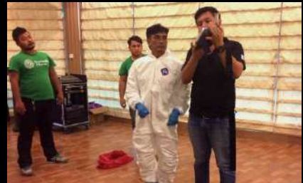
Training by EHA to continue assisting In PREDICT programs