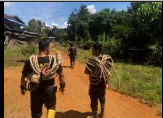
Elephant tracking at Kg. Gambaron 1, Telupid