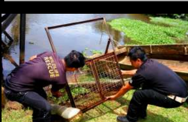
Setting up crocodile trap at Kg. Merabau, Kota Belud