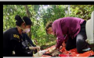
Civet Collaring and Sampling at DGFC, Kinabatangan